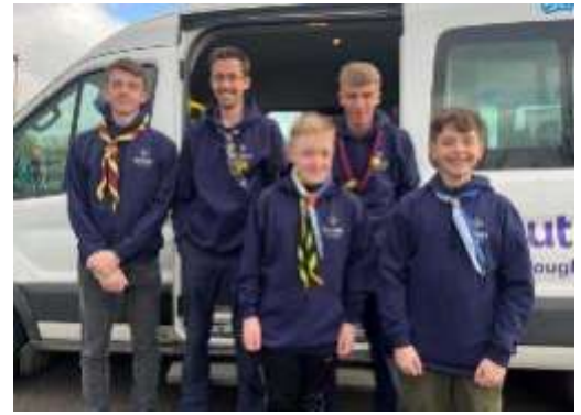
The Cleveland delegation are off on their way to Edinburgh to represent the County in the National Youth Forum!