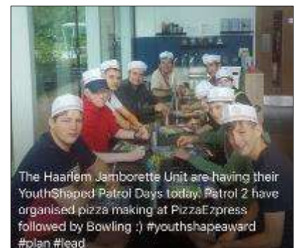
The Haarlem Jamborette Unit are having their YouthShaped Patrol Days today! Patrol 2 have organised pizza making at PizzaExpress followed by Bowling :) #youthshapeaward #plan #lead