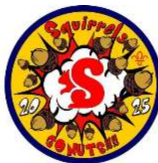
Official badge for Squirrels Fun Day

#scouts #JOTAJOTI #jota #joti #scouting #worldscouting #wosm #jamboreeontheair #jamboreeontheinternet #scoutjamboree