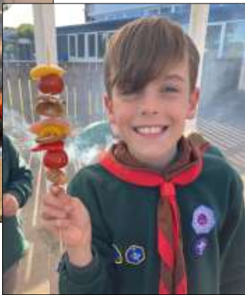
Breakfast kebab cooking at 9th Hartlepool