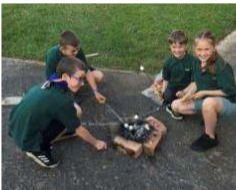
8th Billingham just hanging around at Raven Gill

1st Fairfield Matabele Cubs getting in some serious fire lighting and cooking s'mores.