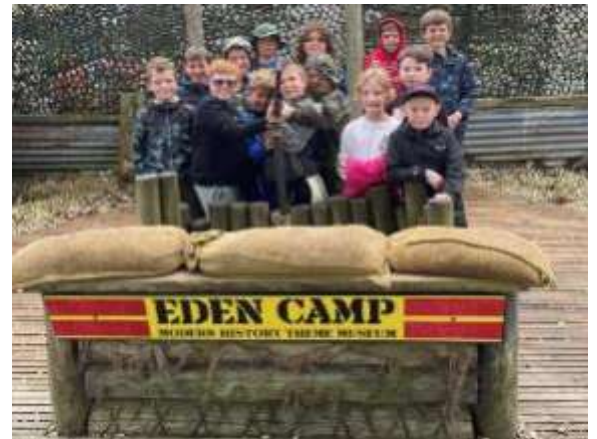
The Time Capsule at 40th Hartlepool.

1st Skelton's Pack Holiday had them travelling through time and landed them at Eden Camp to see what life was like in the Second World War.